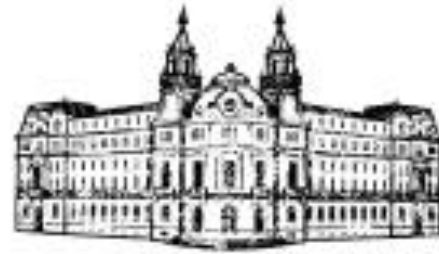
Ministry of Agriculture and Food